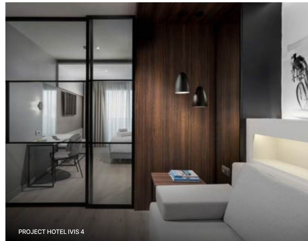
PROJECT HOTEL IVIS 4