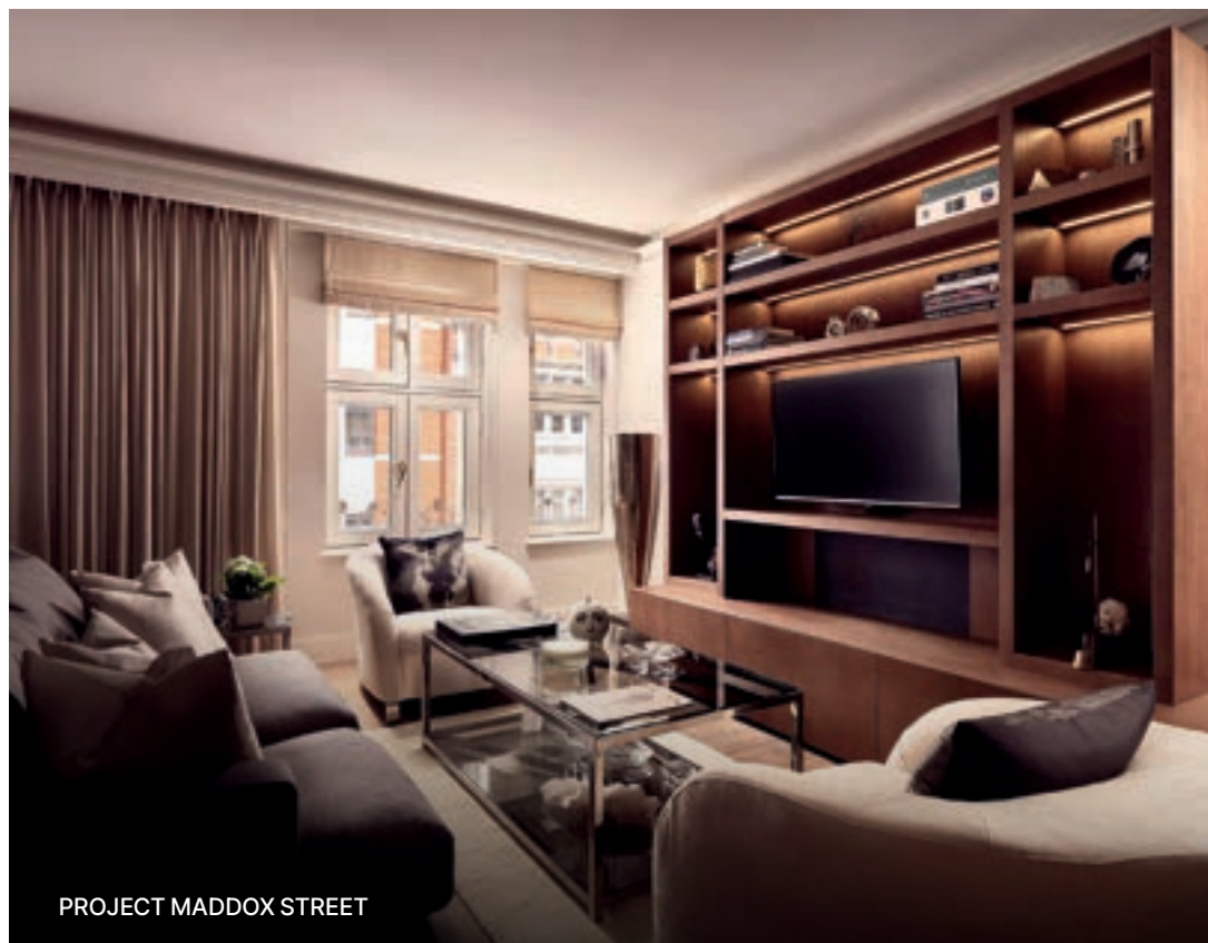
PROJECT MADDOX STREET

Once we identify your project needs, there are no limits to what our team can achieve. For 58 years, with one of the largest factories in Greece at our disposal, we have been making your every wish come true, crafting custom-made furniture, even for the most demanding personalized designs.