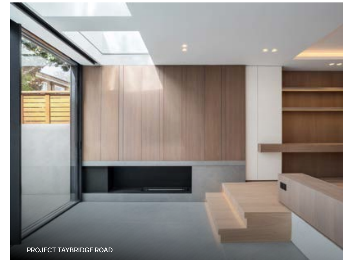
PROJECT TAYBRIDGE ROAD